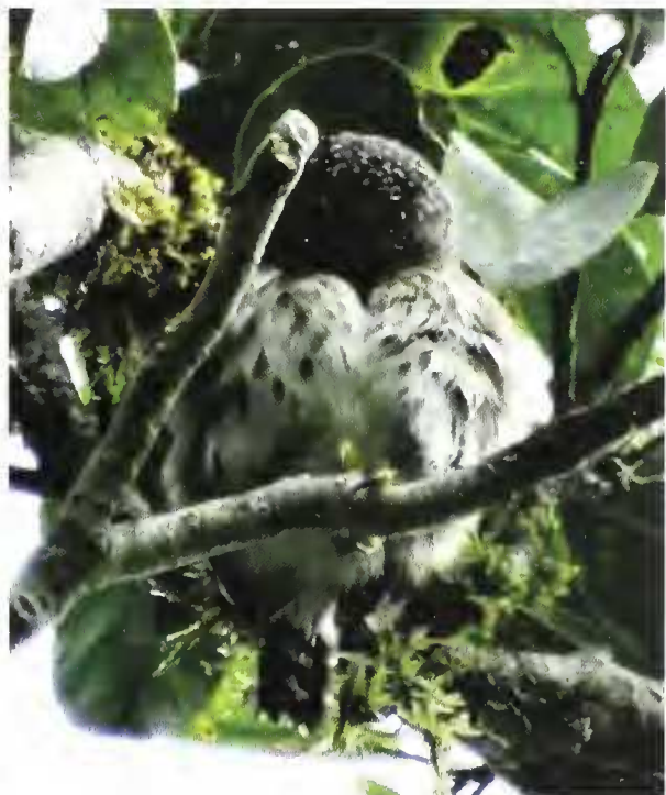
Figure 1. Subtropical Pygmy Owl Glaucidium parkeri , Sibundoy Valley, dpto. Putumayo, south-east Colombia, 18 January 2014 (Judit Jaramillo)

On 18 January 2014, AC, BC-J, WDD & JJ were observing birds between San Francisco and Mocoa, Putumayo (01°04'N, 76°48'W; 1,800 m), where, c.15 km east of the main road, they observed and photographed a pygmy owl (Fig. 1) that was tentatively identified as G. jardinii . It was subsequently identified as Subtropical Pygmy Owl (by JFF) due to its prominent white coronal